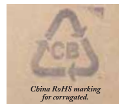
China RoHS marking for corrugated.

Information about China's RoHS law is available at: www.aeanet.org/chinarohs & www.conformity.com .