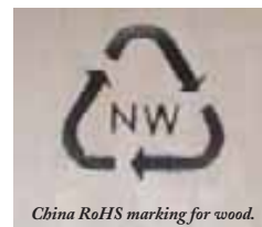
China RoHS marking for wood.